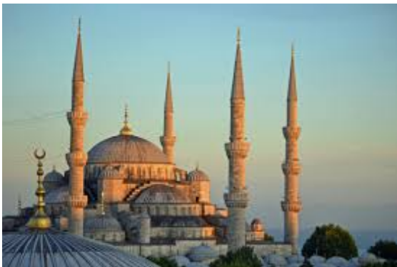
Blue Mosque, Istanbul