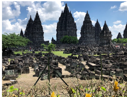
Hindu Temples, Java