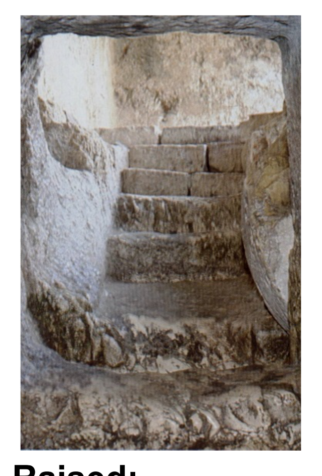
Raised: Regurgitated onto beach